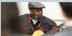
Concert 4 13:30 - 14:15 Sonrisa

Cost to schools for each of the streamed concerts is £10. Please book for your streamed concerts via the booking form at the back of the brochure and you will be contacted to ensure all technical details are in place to receive the stream.