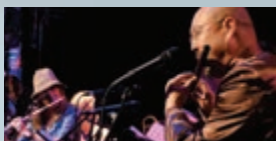
Concert 3 12:15 - 13:00 Grand Union Orchestra