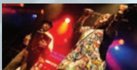
Concert 2 10:30 - 11:15 Breaking Tradition