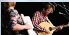
Concert 1 09:15 - 10:00 Megson

4 concerts will be available for you to enjoy through streaming directly from Cambridge Junction to your schools.